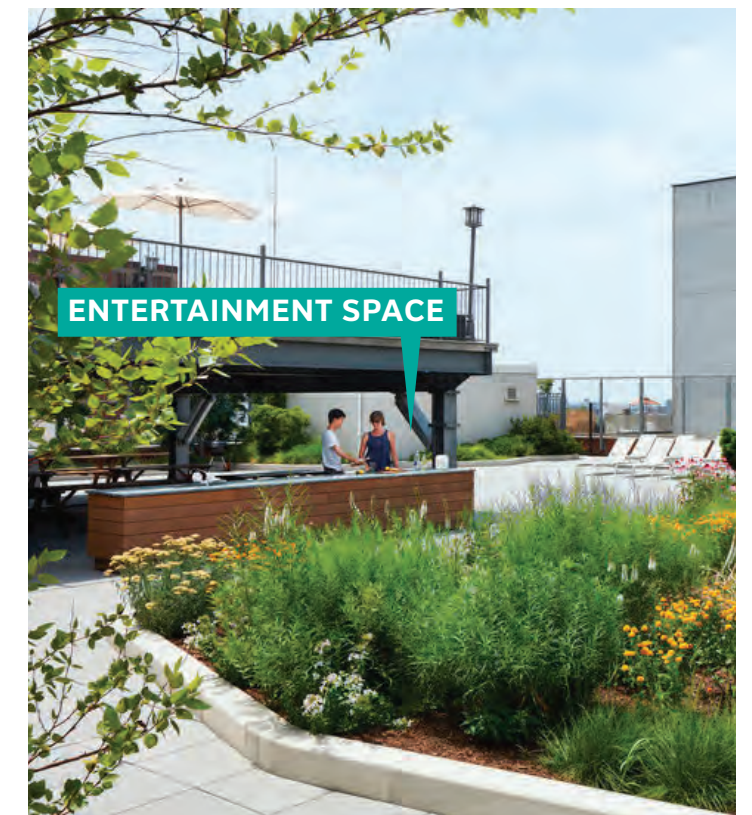
RESIDENTIAL COURTYARD ILLUSTRATIVE PLAN AND PRECEDENT IMAGES