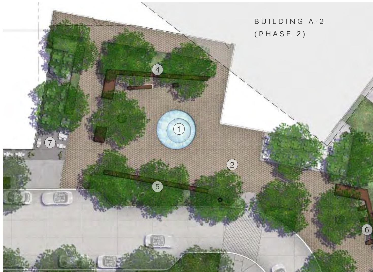
PREVIOUSLY APPROVED - CONSOLIDATED PUD